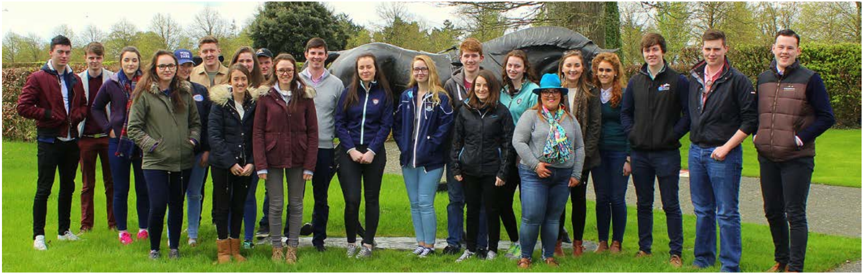
The UL Horse Racing Society with a statue of Yeats, Ascot Gold Cup four times in succession.

While in Ireland we may struggle to call ourselves world leaders in any sport, there's little doubting that this country continuously produces superstars of the horse racing world - both human and equine.