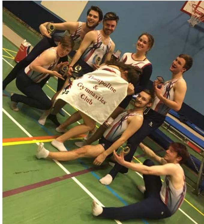
ULTGC members proudly presenting their SSTO medals