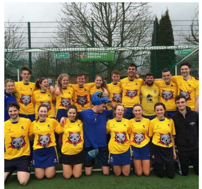
Mixed Varsities trip to Kilkenny where we made the semi-finals.

men's hockey as a part of your new college life make sure you contact one of our members. We will have a booth at this year's Clubs and Societies Recruitment drive in week one where we will be happy to see you. If you'd like to contact us beforehand or have any questions then please message our Facebook page at UL Men's Hockey or find us on the UL's clubs and societies website. Hope to see you in September!