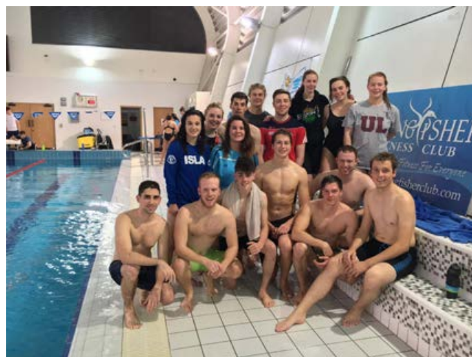
A team photo of the swimmers who attended the NUIG Invitational Swim meet held in Kingfisher Swimming Pool, Galway in November 2016

facilities and coaches we have to offer. The club is not just for competitive swimmers, it caters for all swimmers of any level, from beginners to advanced. Thanks to the brilliant coaches available who are always there to make the best out of a training session to offer any advice that you may need. With the state of the art facilities that are available to us, the club has the chance to train in both 25 metre and 50 metre, allowing us to cater to various levels and abilities. It can be a great way to wind down and relax after a long day. It can also be an effortless way to meet new people who have a similar interest to you. The club hopes that this year will be the most successful year yet and hopes to welcome new swimmers to the team. New members are always welcome no matter what the ability is. Any queries about the club or about training can be forwarded through the club email: ulsc.swim@gmail.com or through our Facebook page: ULSC(University of Limerick Swim Club)