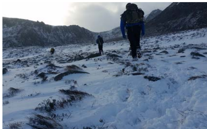
Trip to the Cairngorm mountains in Scotland

These are not the only activities that can be found in ULOPC however as the past year has also been hugely successful for caving and orienteering. Last year saw the largest turnout for an orienteering event the club has seen in years, as well as the creation of a team to compete in intervarsities. Caving too saw a jump in interest, with greater numbers than ever joining caving trips to the Burren, and attending training every Wednesday evening.