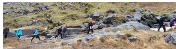
Up the waterfall in the Wicklow Mountains

PARKOUR. What is it? Getting from A to B in the fastest, most stylish or most exhilarating way? That would be in line with popular opinion, but at the UL Parkour Club, parkour has many more definitions. It's a way of training that beats doing reps in the gym or running for hours. You become stronger by challenging yourself, learning new techniques and pushing your body to new limits.