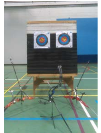
UL Archery Club Equipment

well as bow type, either bare bow like Katniss, Olympic recurve or compound like Green Arrow.