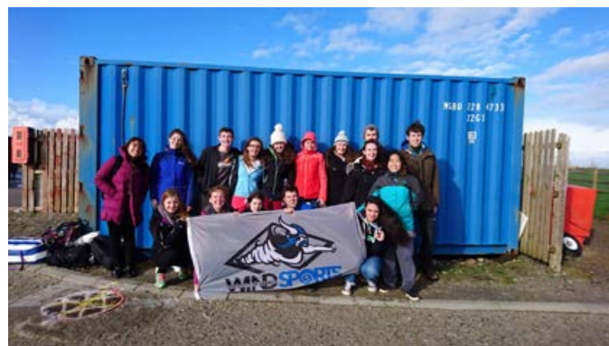
Our club members attending the Intervarsities in Uisce, Belmullet last year

This year our club are hosting the windsurfing inter varsities,