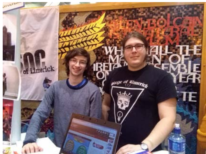
Recruitment drive stand

This coming year, we hope to organise trips to Newgrange and many places in Dublin such as The National Archives, Dublin Castle, Trinity College Dublin and The Chester Beatty Library, where History Society members can enjoy the history that these places have to offer. Along with historical trips, our weekly events express much enthusiasm and it is always lovely to see the new faces that they bring. Our pub quizzes, held once a semester, are filled with historical knowledge. These quizzes create a wonderful opportunity to learn new facts from team mates and peers and there is a Pub Quiz prize for the winning team. For our