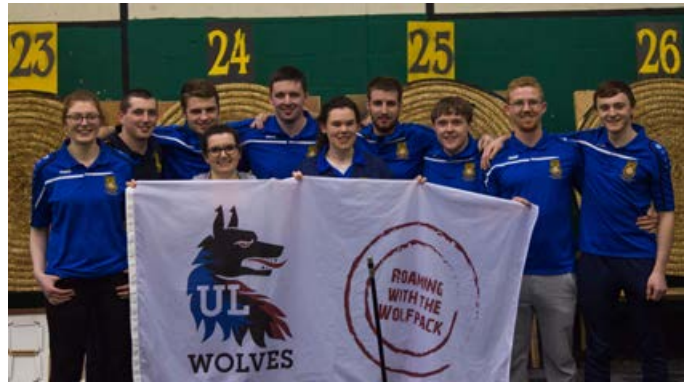
The UL Archery Team attending the Student National Competition in UCC last February