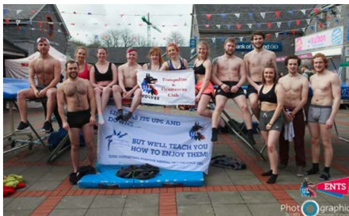
ULTGC members participating in the Nearly Naked Bounce in support of Charity Week 2017