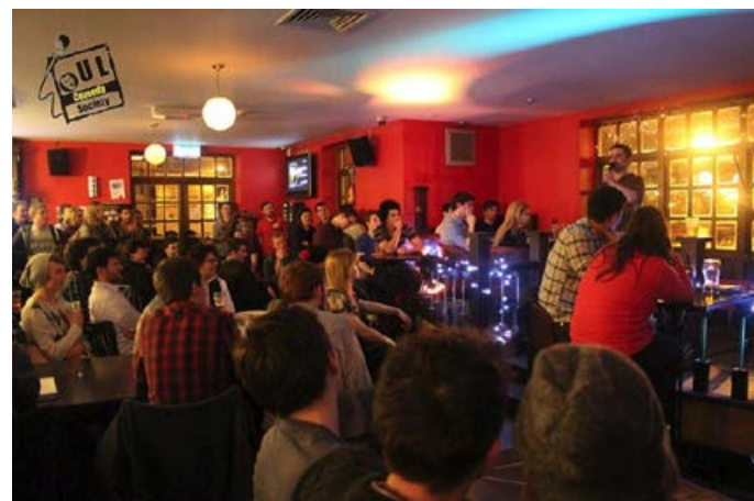
A full house for stand-up comedy in Scholars