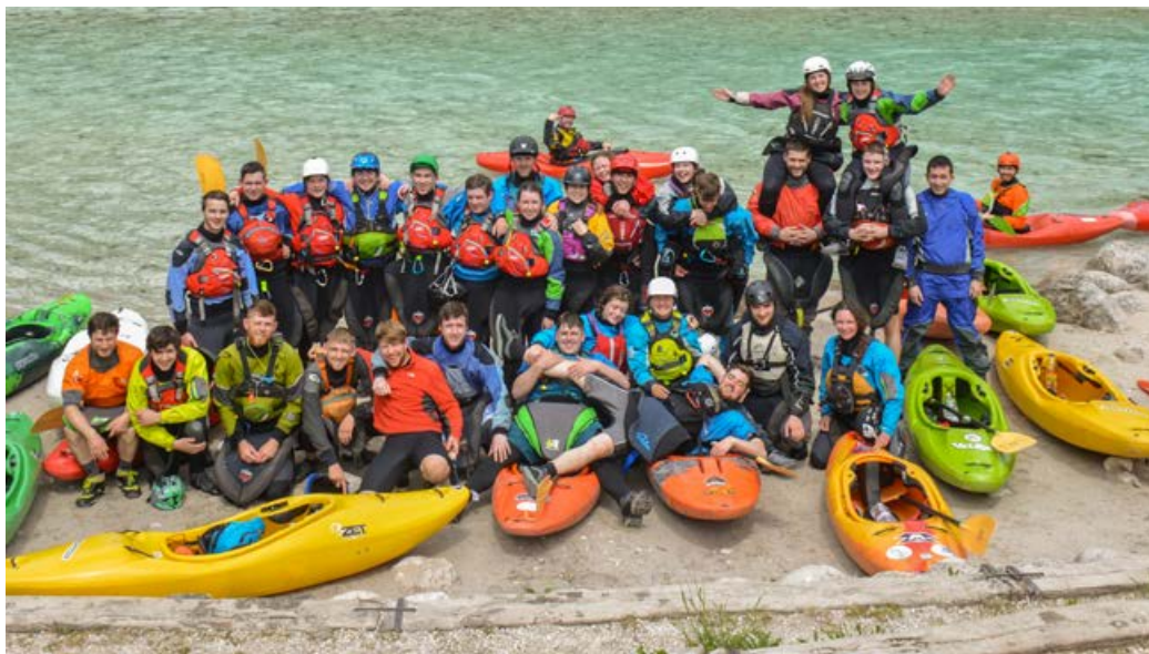
Prijon Factory - Alps

If you would like to be a part of our club and add to your college experience, then come talk to us at the recruitment drive on Wednesday of week 1. You can find us at our stand in UL Sports Arena and we can answer any questions you may have. You can call into the pool to us any Tuesday, Wednesday or Thursday night @9:45-10:45 too. Feel free to contact us on our Facebook page 'University of Limerick Kayak Club', our email ulkayak@gmail.com , our our Snapchat 'ULKAYAK'. SEE YOU ON THE WATER!