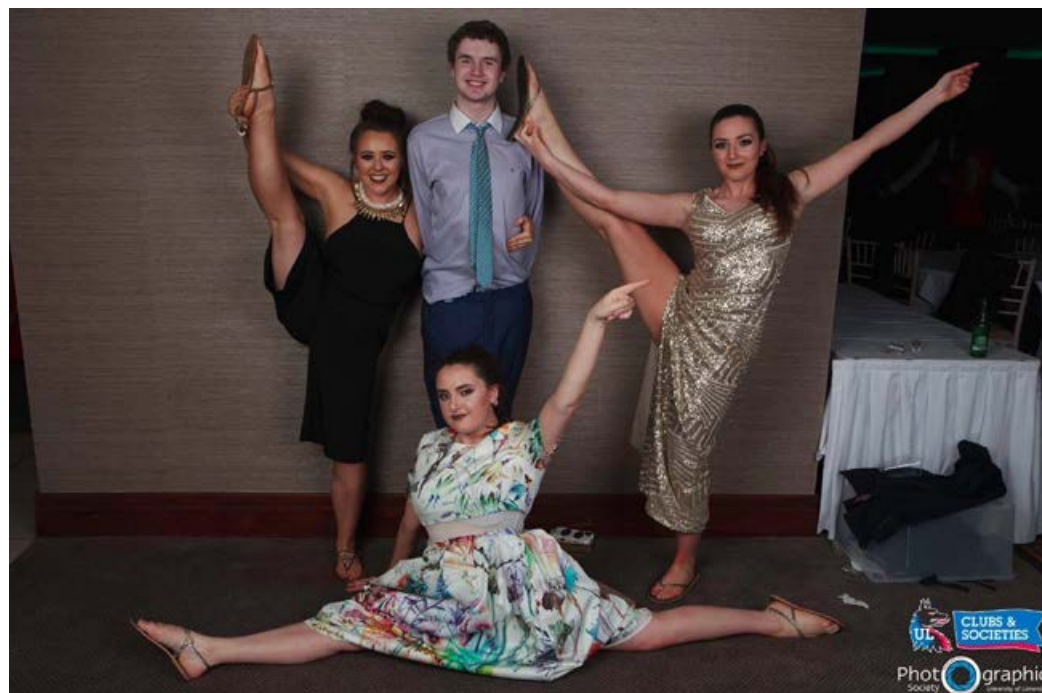
UL CLUBS & SOCIETIES Photographic Society

The Dance UL committee is looking forward to having both fresh and familiar bodies dancing their way to a thrilling academic year!