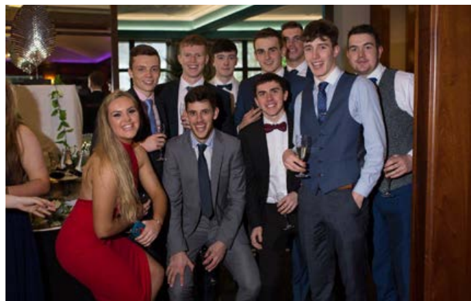
UL GAA members celebrating the season gone by at the UL GAA Ball held at the Castletroy Park Hotel.

We were delighted with the brilliant work from students who volunteered with the club this year. It was especially pleasing to see many students who assisted with coaching, selecting and performance analysis are having their efforts rewarded with President's Volunteer Awards in the coming weeks.