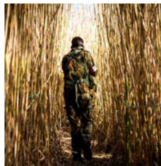
BICS award for the Best Photo. Trip to Redhills airsoft.

We are one of the societies in the Wolfpack having only re-established a year ago! With