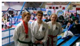
UL Taekwondo at the Intervarsities 2017

As always the club saw huge successes on the competition circuit in patterns, sparring,