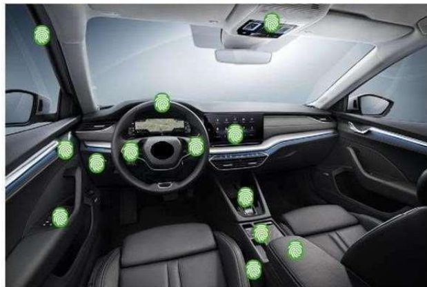
Figure 2: Vehicle Occupancy and Seating restrictions ● STEERING WHEEL ● GEARSTICK ● HANDBRAKE ● DOOR HANDLES ● RADIO AND INFOTAINMENT CONTROLS ● STEERING COLUMN STALKS (INDICATORS, WINDSCREEN WIPERS, CRUISE CONTROL) ● ELBOW RESTS ● SEAT POSITION CONTROLS ● DOOR FRAME