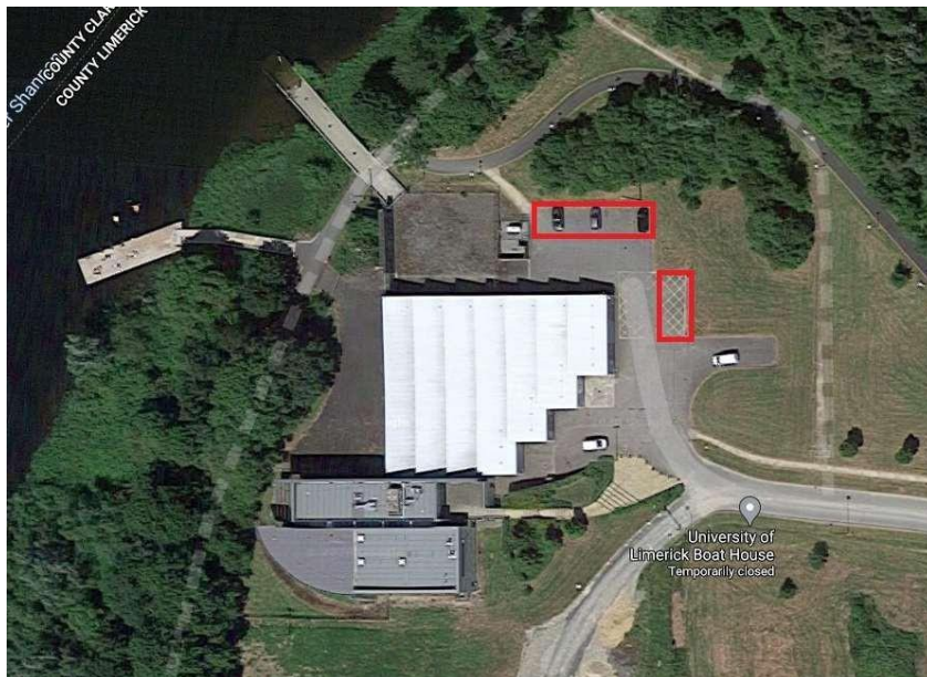
Figure 1: UL Boat House, safe parking marked in red